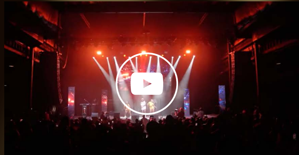
AFRIMMA 2022 AWARDS CEREMONY RECAP