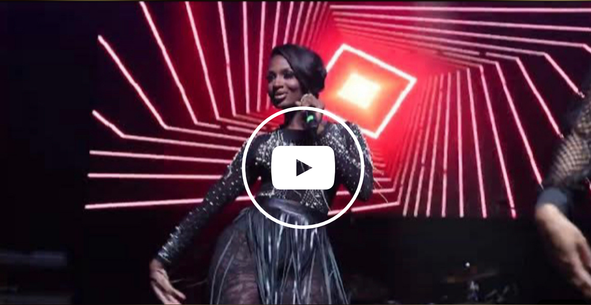
AFRIMMA YOUTUBE CHANNEL