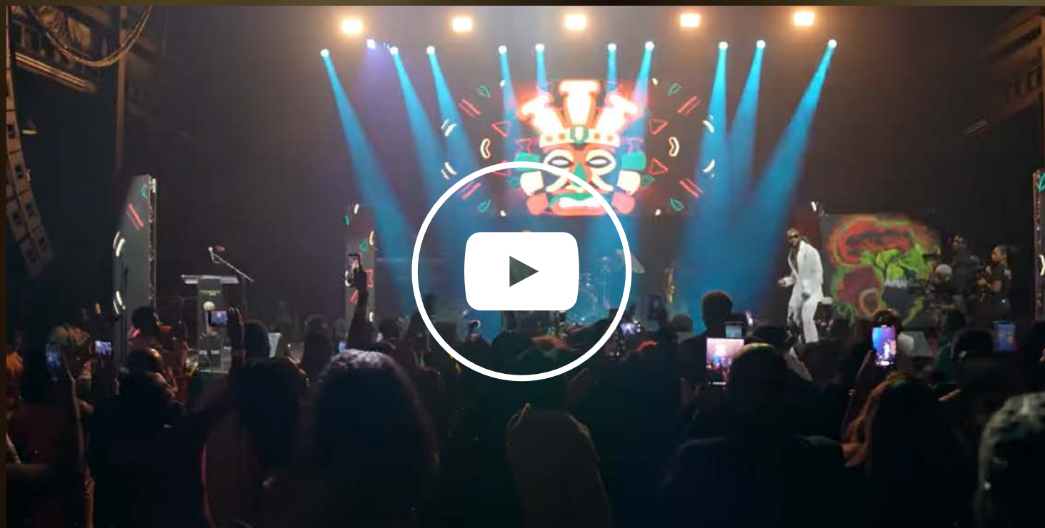
PHYNO AND FLAVOR FULL PERFORMANCE AT AFRIMMA 2022